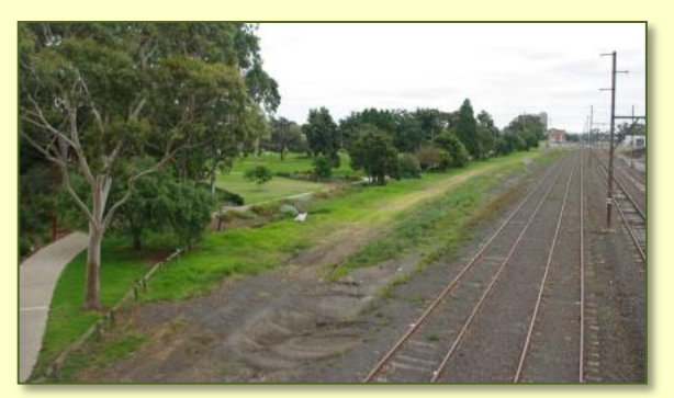
Views from the pedestrian rail overpass