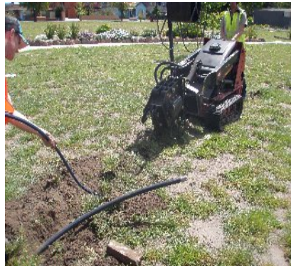
Council installing new irrigation

stress. Even with the new system, leaks can occur. If you spot water leaking in the Gardens please report it to the council.