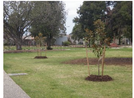
New Magnolia trees

tree loss increases moisture evaporation and thus soil drying and further tree loss.