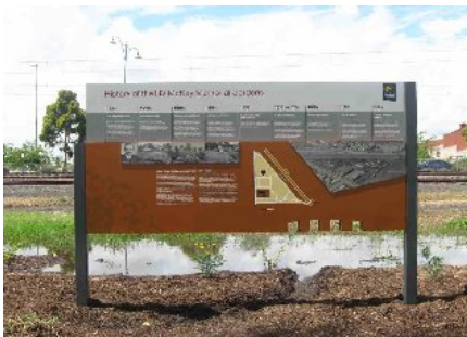
One of the new interpretive signs

The Friends would like to especially thank the efforts of The Sunshine Community Brass Band and the Legless Lizards and the generosity of the Presbyterian church and church community. We would also like to acknowledge generous donations from the Manager of Agco and from the Melbourne Lyceum Club: the ladies had lunch in the gardens on the Monday after our event and were appreciative of our efforts.