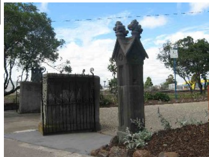
Restored gates and Gothic pillars