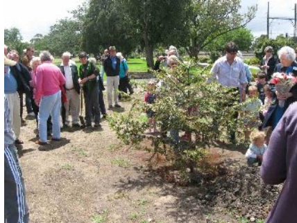
Centenary tree planting