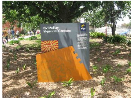
New Entrance Sign

Well our centenary celebrations went off (almost) without hitch. Approximately 200 people turned up to listen to speeches (hopefully not too long) and the bands, to eat excellent afternoon tea, to peruse the historical display and to wander around the gardens. It threatened rain (we can't complain about that) but in the end, didn't. All in all, a good time was had by everyone. We also managed to raise the profile of the gardens not just with the local community but also more broadly across Melbourne.