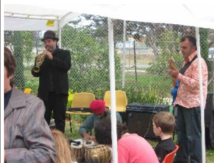
The Legless Lizards playing