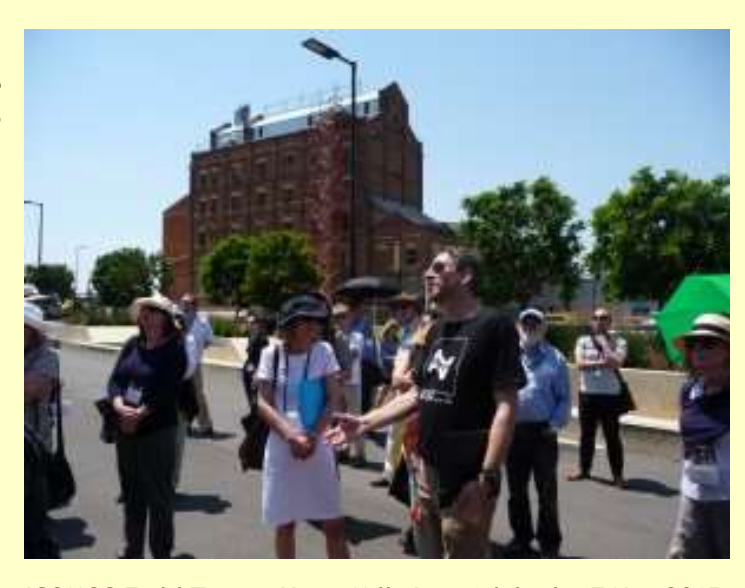
ICOMOS Field Trip to Harts Mill, Port Adelaide, 7 Nov 2015

A key issue is being able to maintain the longstanding but frayed connections between the community and their Gardens. Events such as the Friends' "heritage" picnic are a continuation of a significant tradition of celebrating important events in the Gardens and community use for rest and recreation.