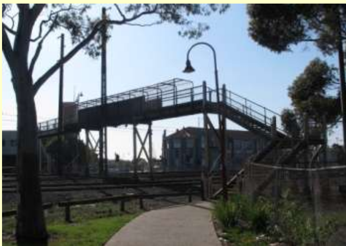
The heritage-listed footbridge

The situation of the footbridge is even more precarious although there appears to be even less justification for interference.