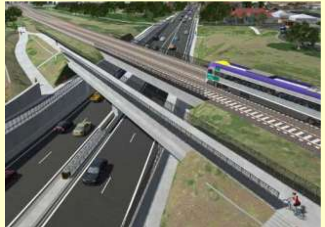
RRL proposal as presented to the public (Gardens are at top left)

"..move the gates..... and acquire that land from the gardens to institute the footpath"