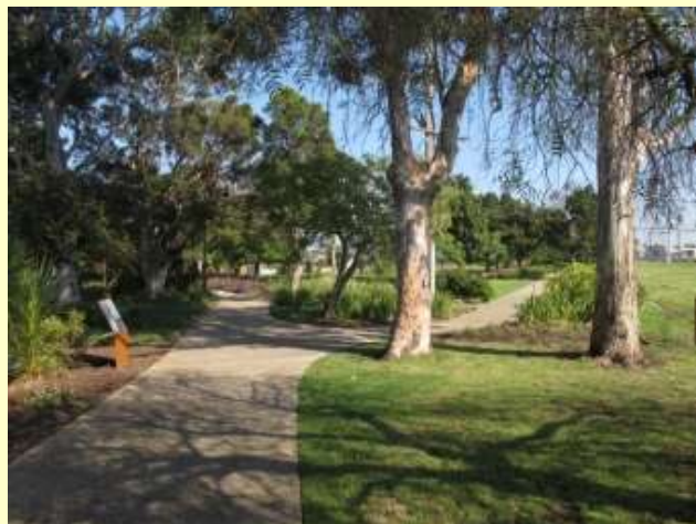
Entering the gardens from the footbridge

“These awards are an opportunity for us as a community to celebrate those individuals and groups who, through their outstanding efforts, make the Brimbank community feel very proud. This year’s winners have demonstrated outstanding leadership and are role models for other community members and organisations.