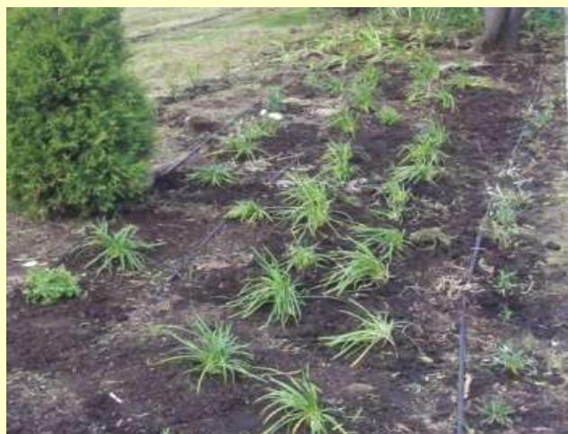
Planting day - June 2011