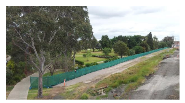
First stage of safety fencing

With the open trench approach, the trench will be 5 metres wide and the total working area will need to